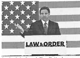
Gov. Ron DeSantis was in Titusville Monday afternoon with Florida Attorney General Ashley Moody at the American Police Hall of Fame and Museum to sign three bills.

"At the end of the day, we've got a pretty good track record on this stuff," DeSantis said.